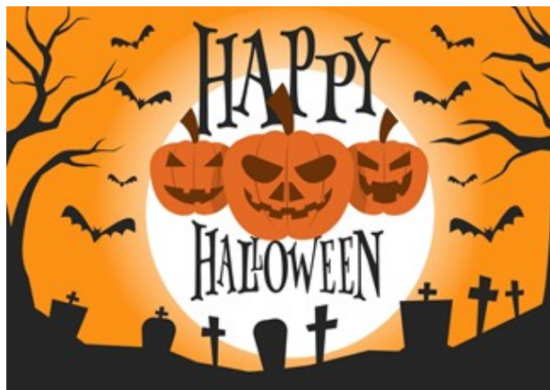
Retrieved 9/5/2020 bing.com

For a Goodreads review , retrieved 9/22/20 E. Heaser