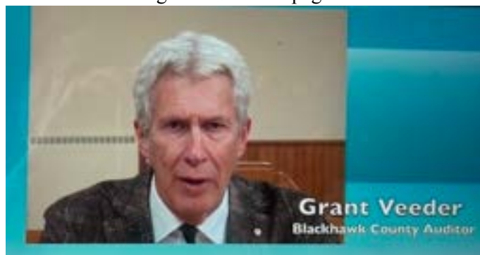
A screen capture from the new video.