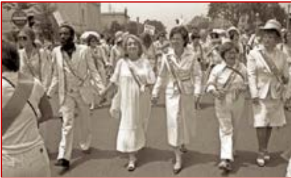
43 years ago, in 1978, leading supporters of the ERA marched in Washington urging Congress to extend the time for ratification