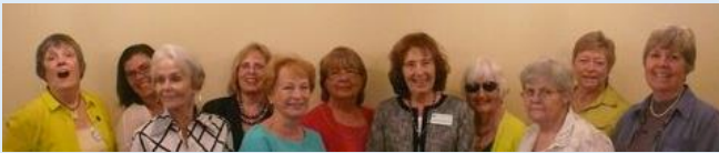
LWVNCSD Officers/Directors 2014-15