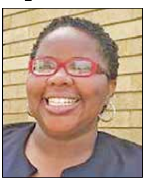
Occupation: Youth Development Coordinator Age: 41 Website: MsKForDistrict3SB.com