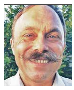
Occupation: Carpenter Age: 46 Website: MattatLarge.com