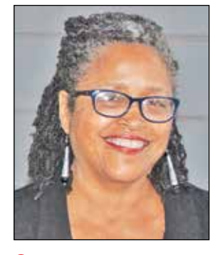
Occupation: Community Organizer / Educator Age: 54 Website: NehandaForDistrict7.com