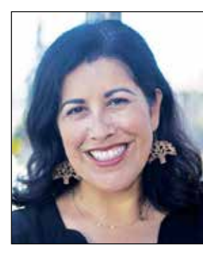
Occupation: Attorney Age: 47 Website: rosieforoakland.org