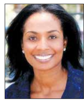
Occupation: Non-Profit Executive Director Age: 42 Website: hodge4oakland citycouncil.com