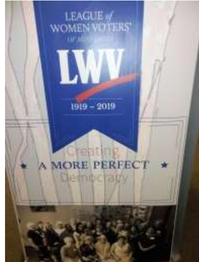
Figure 4: Banner introducing the exhibit