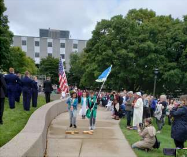
Girl Scouts lead the flag ceremony at the Women’s Suffrage Memorial event.

Many attendees dressed the part! We could do something like this for the opening of the LWV ABC history display at at our public libraries this winter!