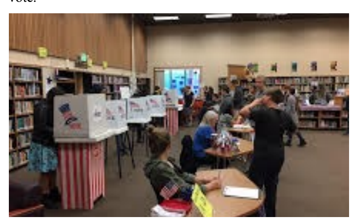
Arcata High School's Mock Election

JB: Students prepared to vote in the mock election by working with history teachers for the last three weeks discussing candidates and propositions. They came in prepared with notes and their own voting guides to help them vote.