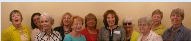
LWVNCSD Officers/Directors 2014-15