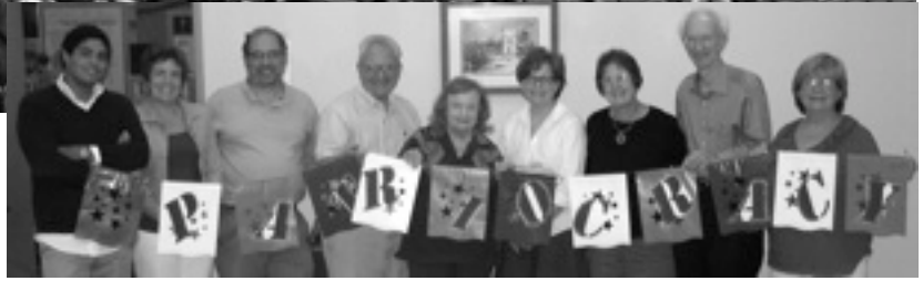
Democracy in the Balance? Getting Beyond the Shouting September 6 and 7, 2012