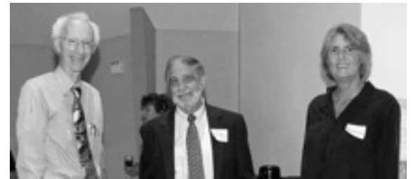
For More Event Photos, go to: http://www.lwvncsd.org/Events.html