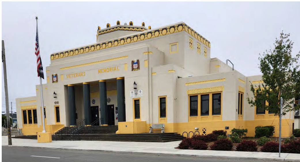
Veterans Memorial Hall, 10th and H Streets, Eureka, CA

Catering by: McKinleyville High School Catering Class