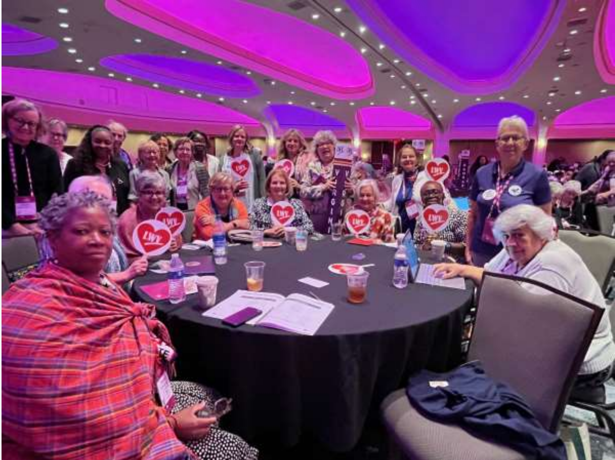
Your Board at Work