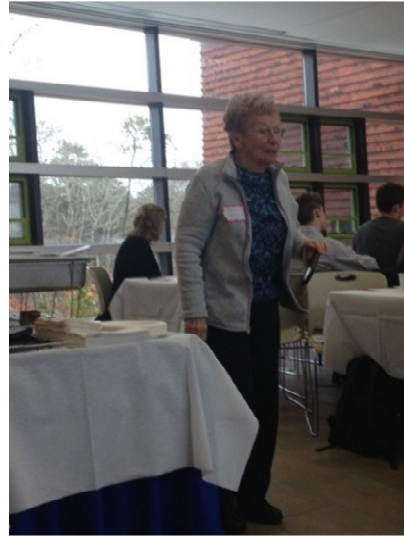
Our "hostess with the mostest"