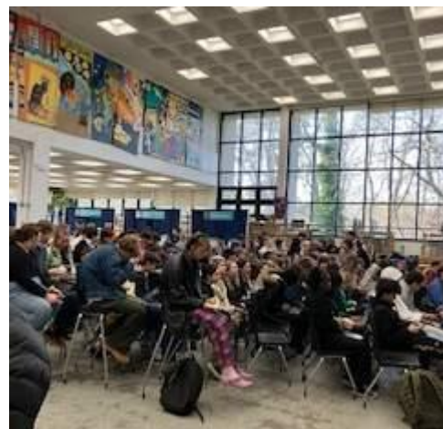
Nauset HS Liberatoria