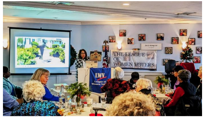
December 9 at the Family Table Collaborative

Forty members and guests gathered at the Family Table Collaborative for our December 9 Holiday Membership Meeting. With some time to socialize, attendees had a chance to talk with members they'd not met before and to enjoy a delicious light buffet lunch.