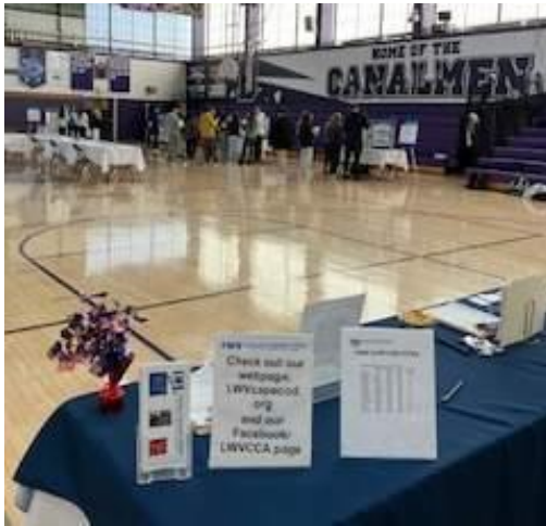
Bourne HS Gymnasium

Finally, we had more voter registration / information tables at Bourne (Dec 8) and Nauset (Dec. 13) High Schools in conjunction with the Credit for Life seminars put on by Cape Cod 5. At each event there were around 100 students, at least half of whom stopped by our table. Those with drivers' licenses checked their registration status with our QR code. They found that they were, indeed, registered to vote thanks to MA Automatic Voter Registration (AVR). The AVR law passed four years ago with persistent lobbying by The League and our election-reform coalition partners. The students without drivers' licenses were given voter registration cards to fill out. Students 16 and older can pre-register to vote. Those who knew the last digits of their Social Security number, filled in the registration cards right then and there. The others were given registration cards to take home, fill out and mail to their town clerks. We had plenty of election information at the table, such as the 2024 election dates. (See attached!)