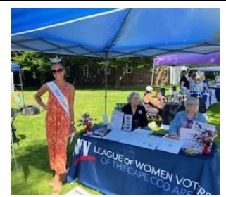
Miss Cape Cod at Amplify POC