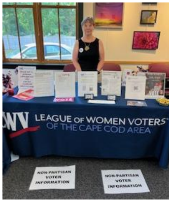
Brewster Ladies Library: Our table

We are also working on the DEI Event: Get Out The Vote. This new event will be on Saturday, September 28th at the Hyannis Green between 1 and 4 pm. The goal is to attract 18- to 29-year-old adults and help them to register and/or encourage them to vote. The Barnstable Town Clerk's office will be participating, and rumor has it that an actual voting booth will be there!