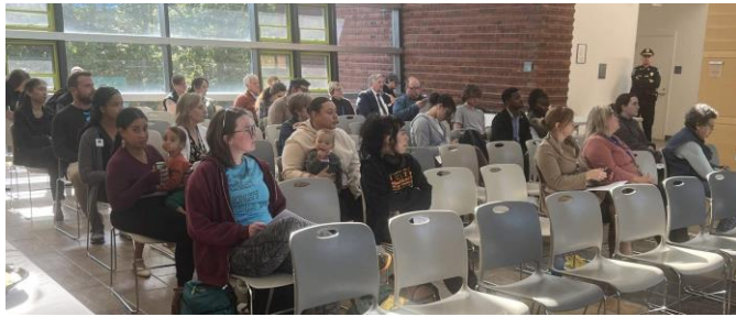
Approximately 30 students and staff attended the event.

Students asked questions of the panelists that fostered a good discussion of issues. People asked how they could learn who their legislators are and how to influence them. One student asked about how misinformation in the media can be addressed and we shared a very helpful resource from the college library that gives tools for fact checking, understanding criteria for professional journalism, and recognizing misinformation.