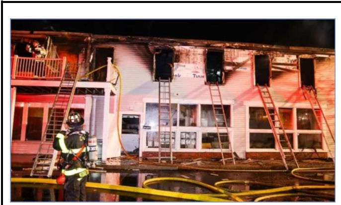
Brazilian Resource Center in Hyannis

...that the Cape recently suffered a heartbreaking loss when a devastating 2-alarm fire destroyed the Brazilian Resource Center in Hyannis?