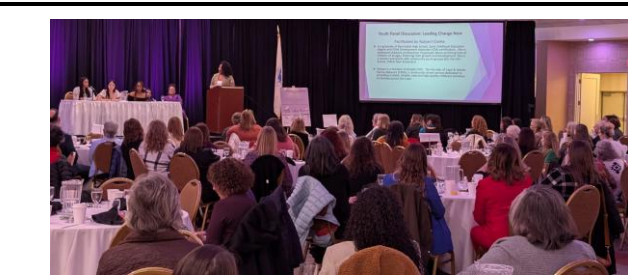
Youth panel discussion on "Leading Change"