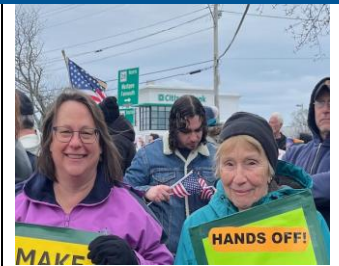
Hands Off Hyannis