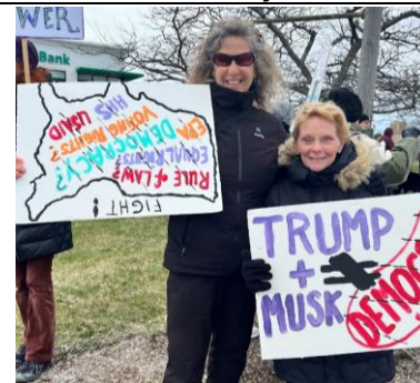
Distress signal at Hands Off Hyannis