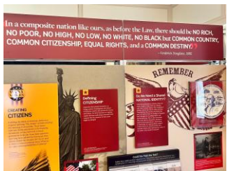
At the bottom of this display, there was a test! We passed!

found 14 students who did not have licenses and 10 of those students chose to obtain registration cards from us.