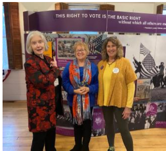
LWVCCA members working hard at the Nye Museum!

Members of the LWVCCA Legislative Committee and Board welcomed visitors to Smithsonian's Voices and Votes exhibit at Sandwich's Nye Museum. We thank all our members who represented the LWVCCA throughout the run of this spectacular exhibit.