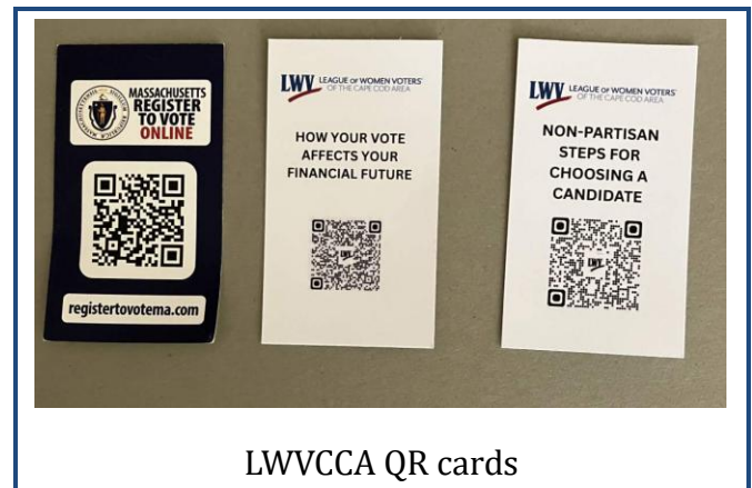
LWVCCA QR cards

teamed up again to participate in the Credit For Life events put on by Cape Cod 5 Bank. We visited Cape Cod Tech on March 24, 2026; Mashpee High School, April 1 and Bourne High School, April 17. Depending on the school or the day, we processed from 50 to 200 students in an hour. Some days we are lucky enough just to explain how they can check their voter registration status; give them guidance on voting and finance; and steps on how to choose a candidate. With practice and experience we discovered that using QR “business” cards is the most efficient way to get our message across on the importance of informed voting. Here are our cards: