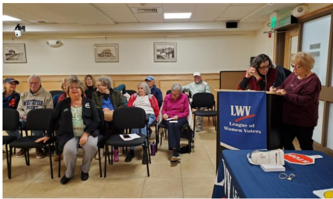
Audience at the April 21 Forum