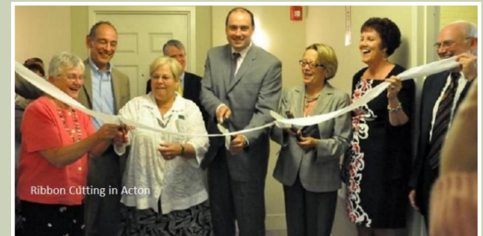
Ribbon Cutting in Acton

November 1, 2019 League of Women Voters (Concord-Carlisle)