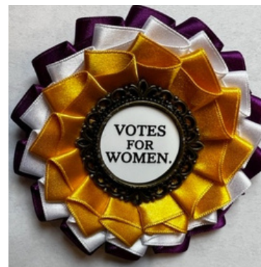
Handmade Cockades $22 each