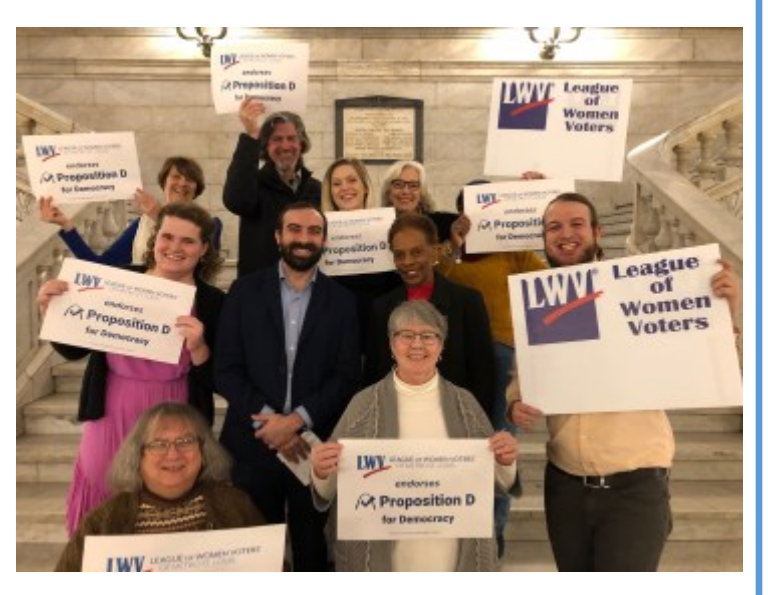
Prop D petitions are available in the League office. For more information, go to <a href="https://stlapproves.org/">https://stlapproves.org/</a>.