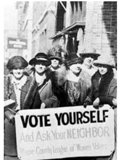
On the Shoulders of Giants....