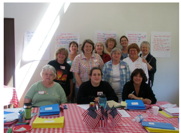
The LWVHC Board in 2007