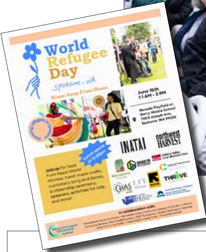
World Refugee Day celebration on Saturday, June 15, 2024 at Garry Middle School, Spokane, WA.