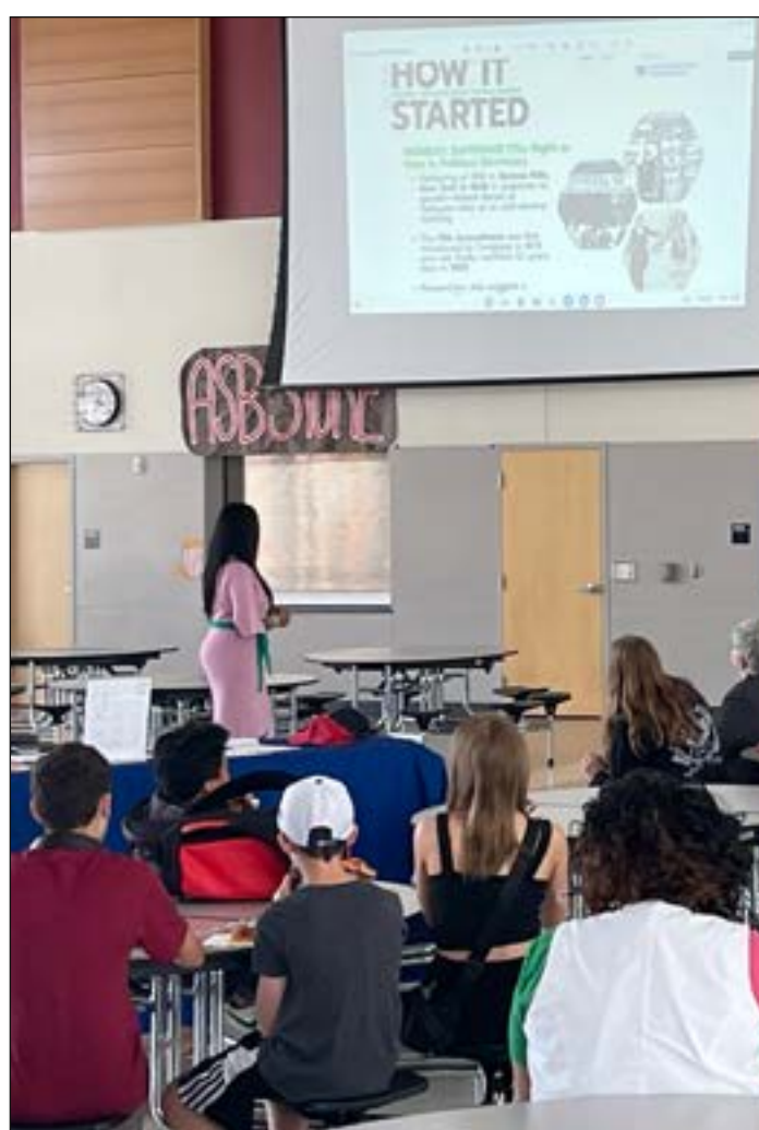
Above: IVY Project organizers, special guests, and North Central High School students during and following the workshop following workshop on May 28.