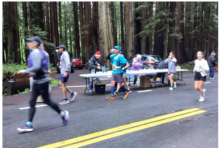
The runners kept the volunteers busy, but we had a great time!