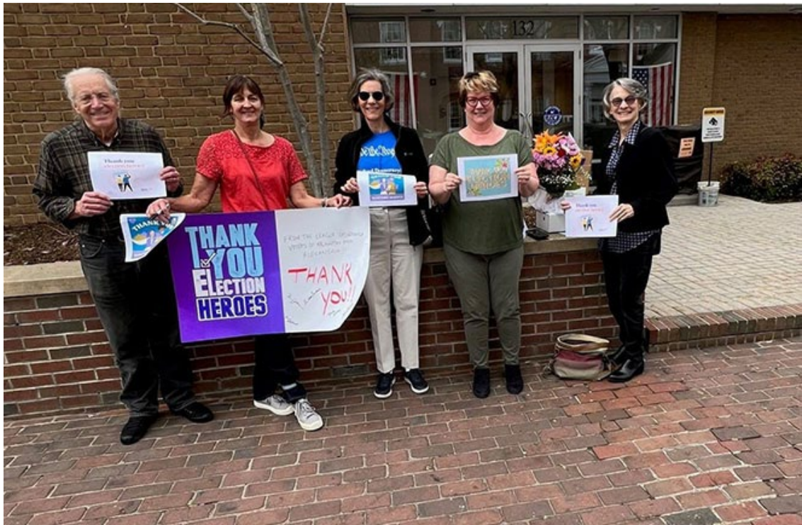
Volunteers showing appreciation in Alexandria