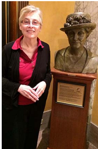
AND next to the bust of Carrie Chapman Catt in the lobby of the Hermitage Hotel