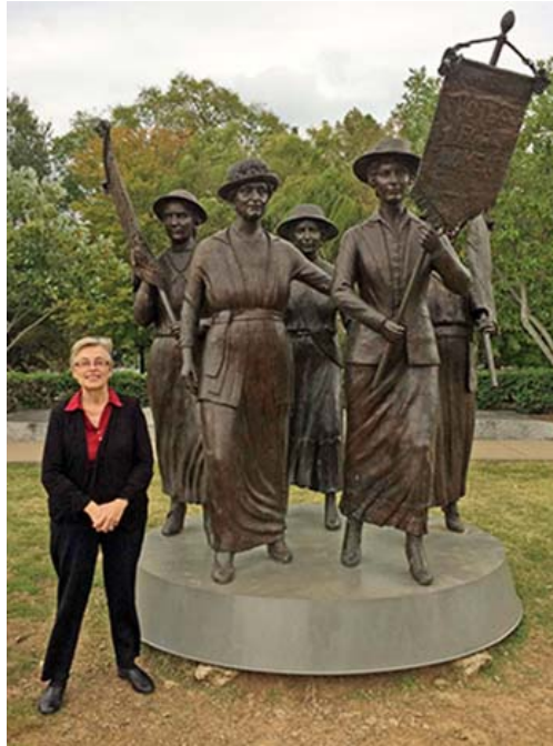
in front of the "Perfect 36" statue