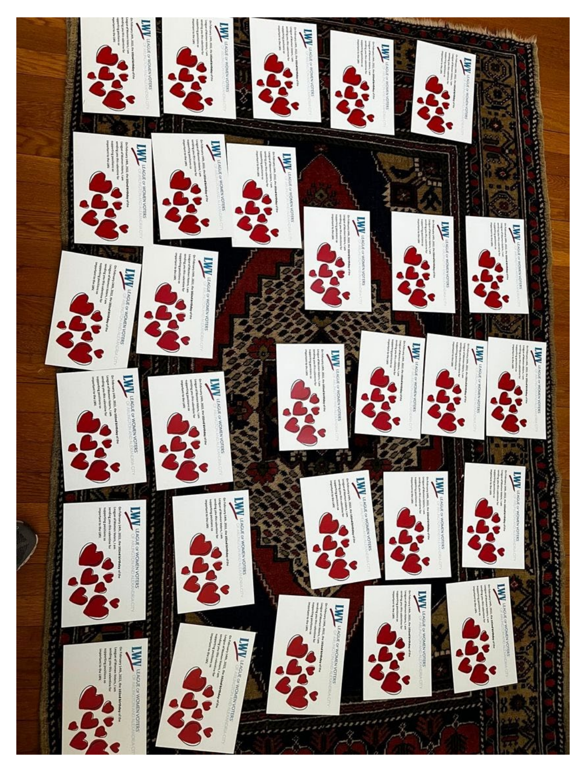
We are celebrating the 102nd birthday of the League by thanking our elected officials who support League intitiatives. #lwv102