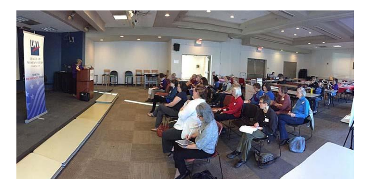
Feb 3 – 8:30 AM – come to one come to ALL!

WLRTs will be virtual – so tune in and see all of the great work the League is doing this year.