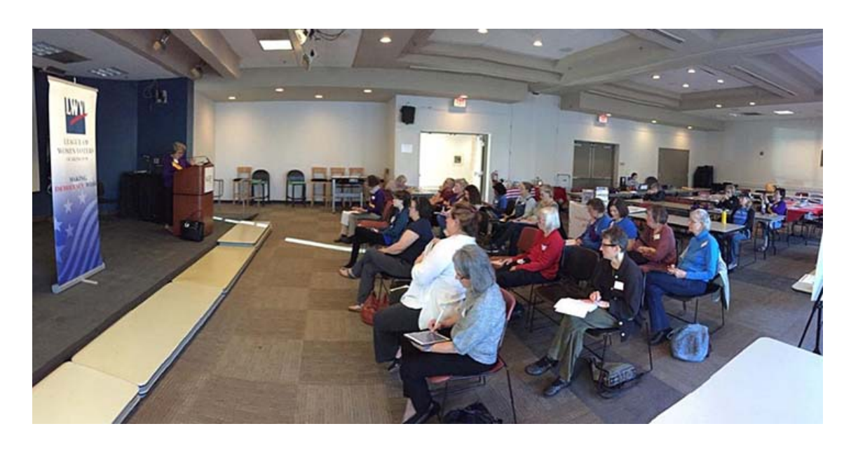
Jan 13, Jan 20 and Feb 3 – 8:30 AM – come to one come to ALL!