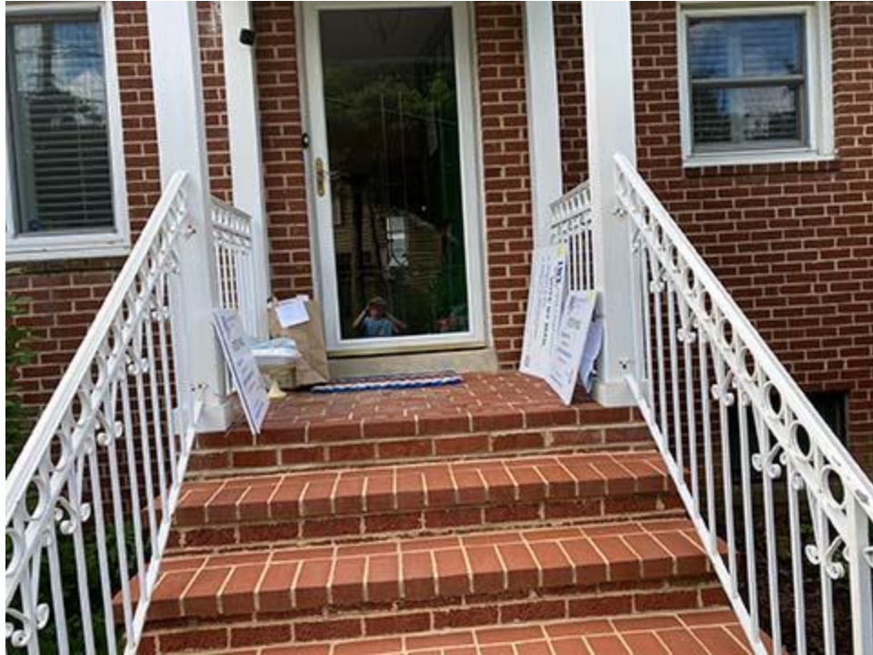
Distributing voter information in the time of Covid - Joan's front porch on any given day