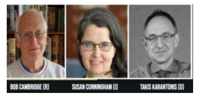
Candidates for Arlington County Board Election March 7

The forum was co-sponsored by the LWV of Arlington, AAUW Arlington Branch, NAACP Arlington Branch, the NoVA Section of the National Council of Negro Women (NCNW), and the Virginia Interfaith Center for Public Policy.