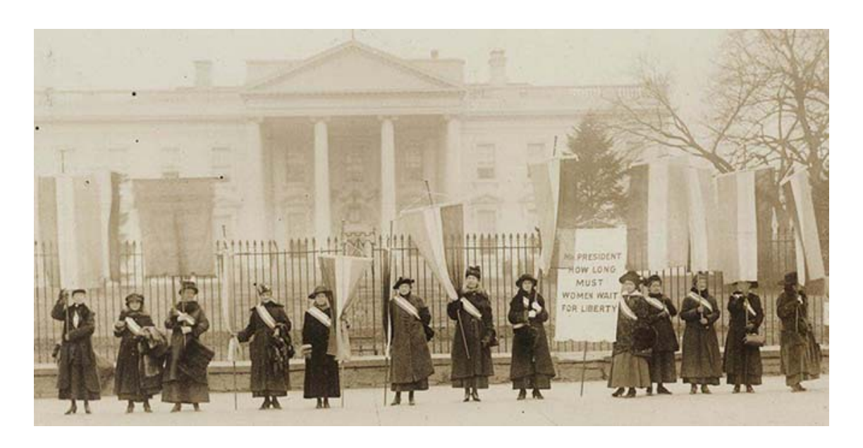
Centennial Corner – Mid-June 2020

Centennial Corner is a regular feature of the League in Action e-newsletter to celebrate three centennial anniversaries in 2020 : the ratification of the 19<sup>th</sup> Amendment, the creation of the League of Women Voters, and the naming of our county as Arlington County.