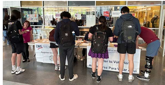
Lunch time voter registration May 11