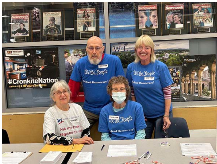
We had a good day at W-L on May 15 registering (or preregistering) 40 students.