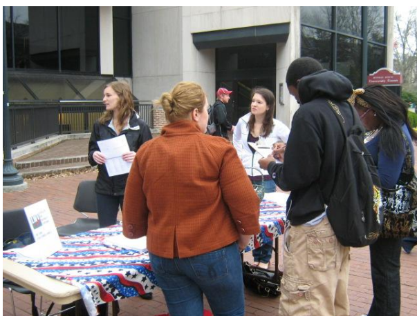
Registering Voters at USC