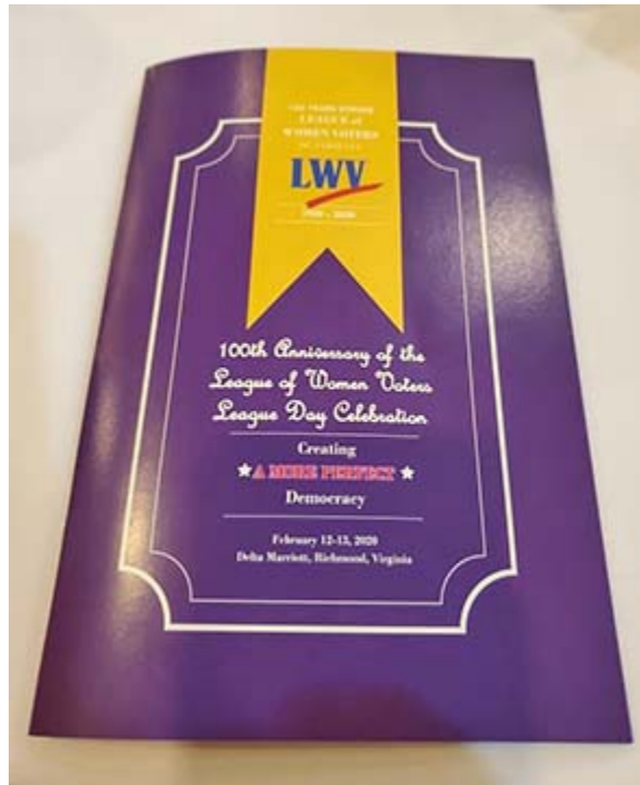
LWV VA Centennial luncheon booklet