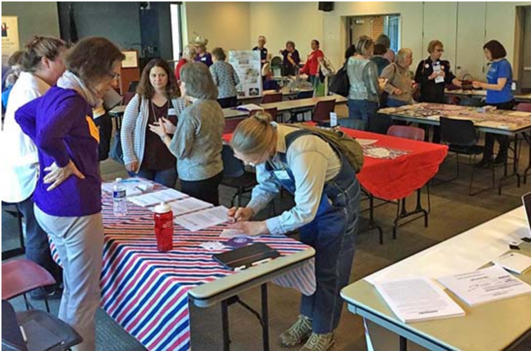
The event featured tables devoted to various issues with opportunities to access information and write postcards to legislators.