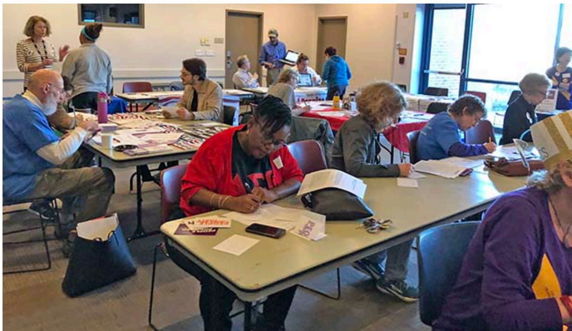
Advocacy one postcard at a time