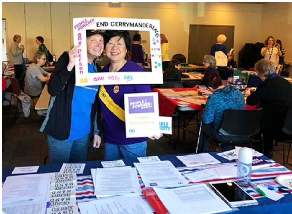
Advocating for fair redistricting