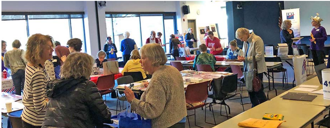
LWV-Arl observed the opening of the 2020 VA Legislative Session With a Day of Action Jan 12