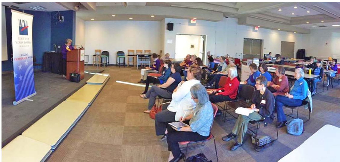
The Day of Action was preceeded by a brief membership meeting to discuss League policies, voter registration and the League's role in 2020 and 2021,