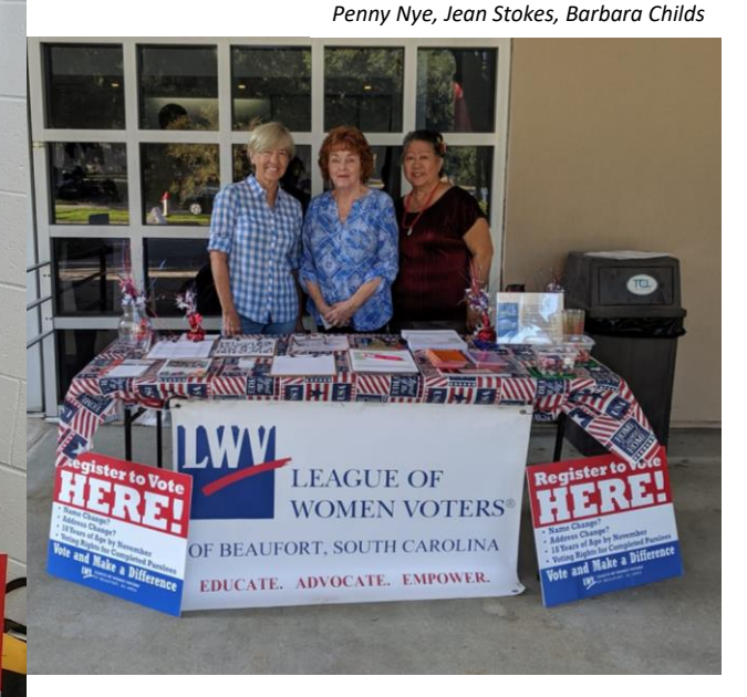
Voter Services is looking forward

to a new and even more effective year in 2020! Our committee is working to establish places for existing and incoming volunteers as we build out our calendar for the upcoming election season.