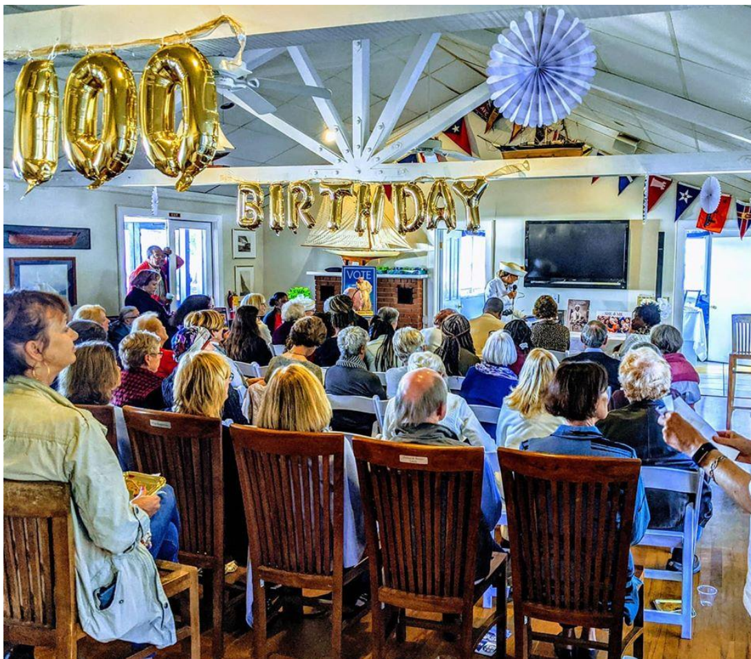
Check out additional photos of the Soiree on Pages 13-15.