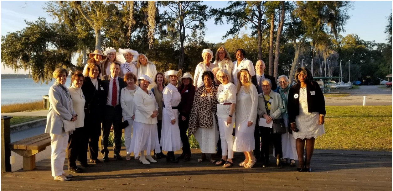
League Members and Friends