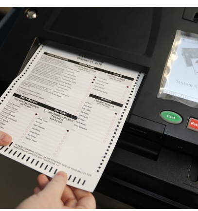
Paper ballot fed into a scanner

been advocating for a paper ballot system for two years. The League would like to see it up and running for the November election, but we are told it likely will not be operational until the May 2020 primary election.