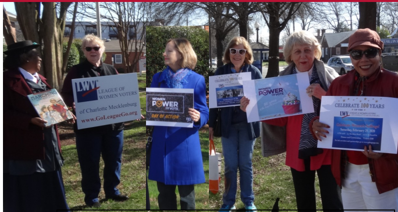
League members gathered for a press conference to mark the League's Day of Action on its official birthday, Feb. 14.