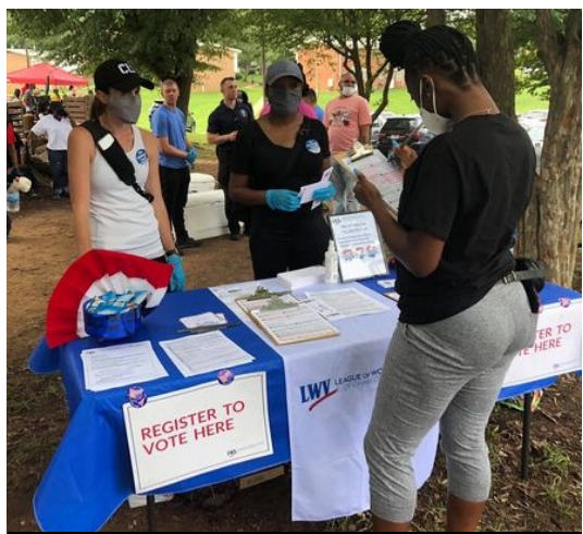
Voter registration at Dillehay Courts

The Board of Elections has assured us that early voting sites, as well as the regular polling places, will be adhering to all safety guidelines. All poll workers will have PPE, ballot machines will be cleaned and all workers and voters will be socially distanced. The BoE is working hard to ensure that voters who chose to go vote in person will be safe, along with protecting the health of the poll worker.