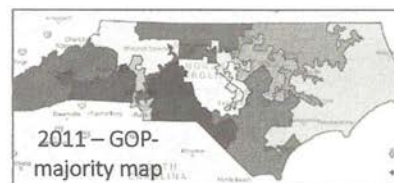
2011 – GOP- majority map Both parties have gerrymandered NC

Politicians now use sophisticated computer programs to choose their voters more precisely than ever. They don't have to compete for your votes: the maps make the winners almost a foregone conclusion. Voters can't hold their representatives accountable. This isn't how democracy is supposed to work: voters should choose their representatives, not the other way around!