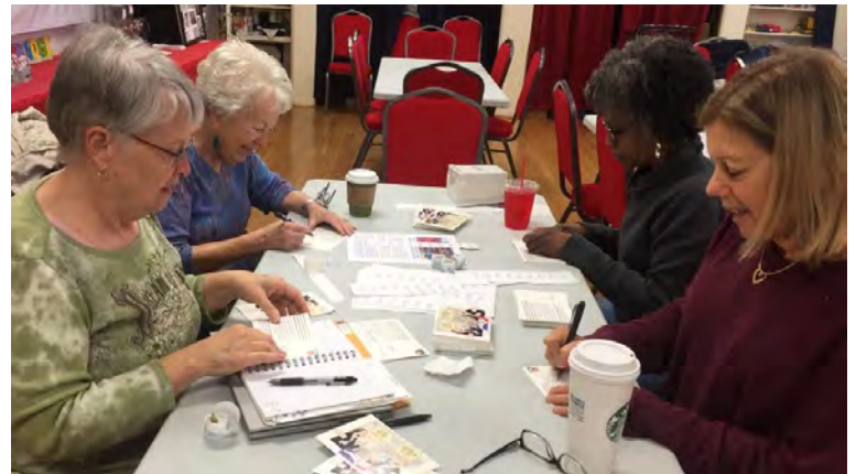
Above, FEAT members meet to address postcards being sent to voters in Mecklenburg and surrounding counties urging them to support the Reasonable Redistricting Reform movement.