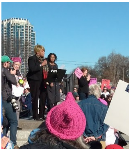
Delores speaking at women's march.

Tactics of divide and conquer - by race, religion, gender and socio-economic status are now how the United States is known around the world.