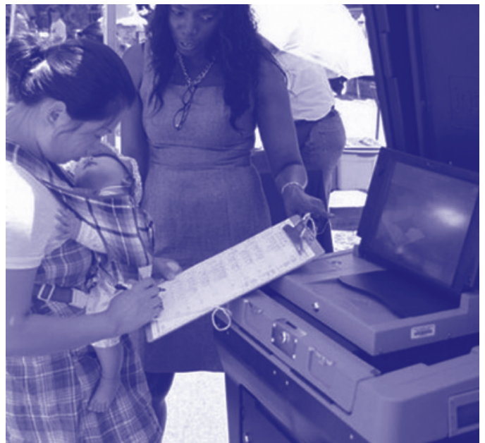
The Board of Elections demonstrates how to use the new optical scanning voting system.