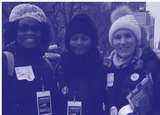
LWVNYC voter registration volunteers at the New York City Women's March, January 19, 2019.

Helpful tools to contact your elected officials. Go to the website mygovnyc.org prepared in partnership with the CUNY Graduate Center.