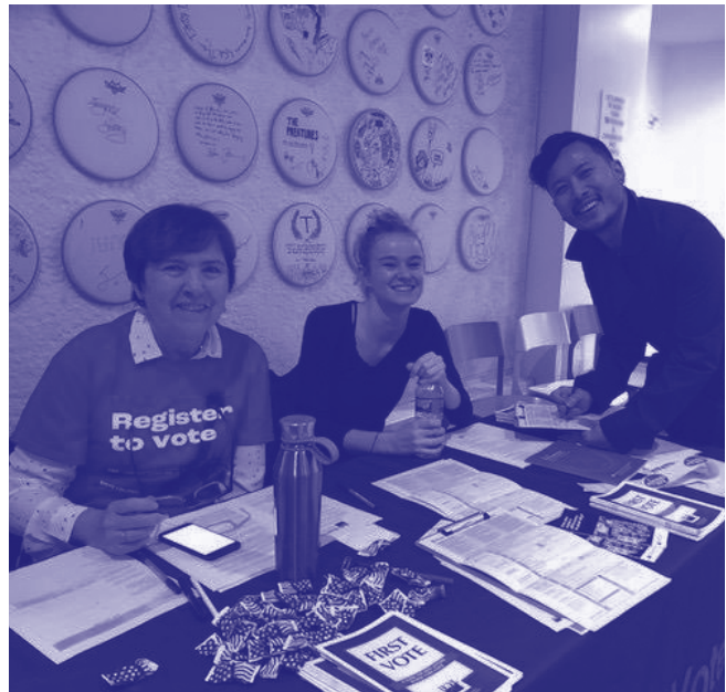
LWVNYC voter registration on National Voter Registration Day, September 25, 2018.