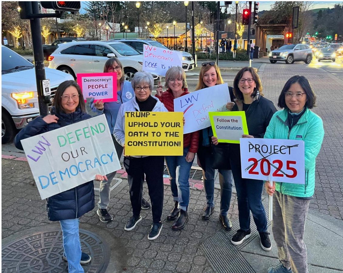
League members joined other community groups in Walnut Creek for Light for Our Democracy demonstration, March 4, 2025.