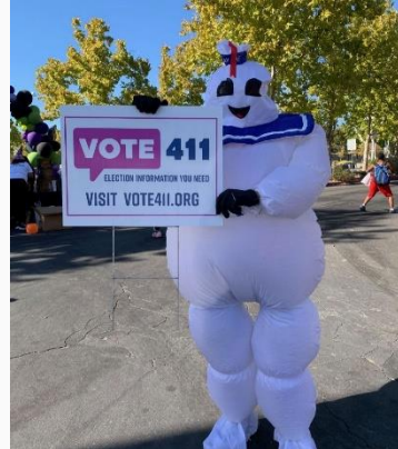
Sign of the season!