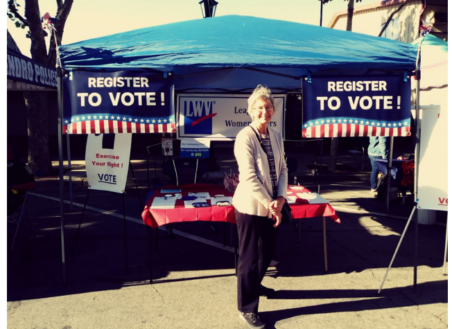
League booth at the San Leandro Farmers Market