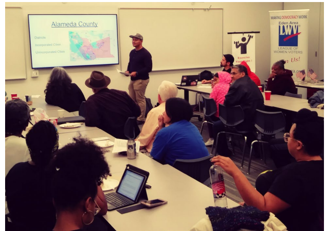
Cherryland neighborhood community meeting