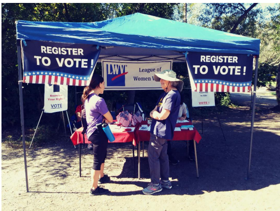
Lake Chabot Peace Walk